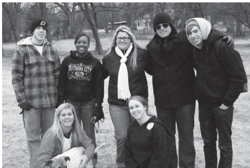
Residents from the Spears School of Business Communities (Villages E and F 4th Floors) participate in numerous community service projects like walking and playing with the dogs at the Stillwater Humane Society.