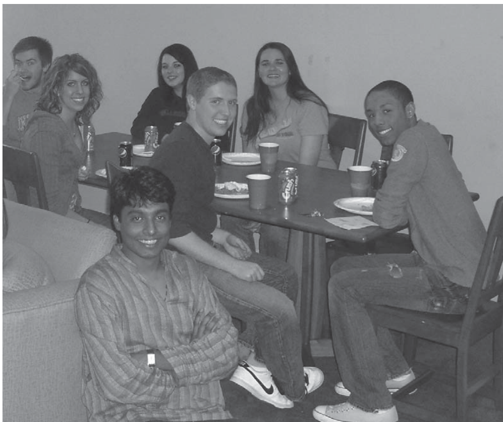
A group of students from Village Hall F's India Night enjoying their authentic Indian food.

Wentz Hall is a very active community and they sponsor Wetnzdays every Wednesday, and they just had a very successful "How to Work Out Properly" program. They are also collect-