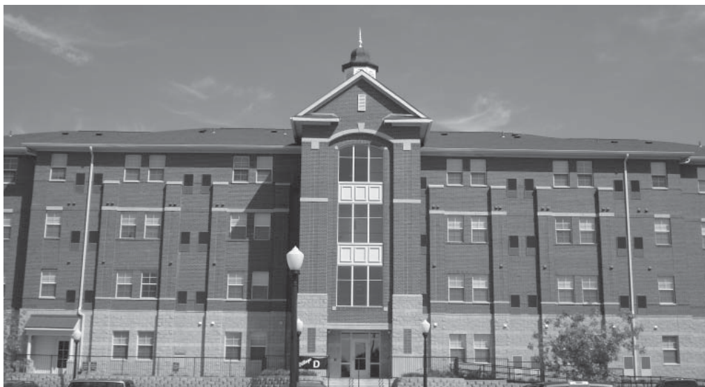
Village Hall D is the new home for the Study Abroad House. Residents will be living in one bed/one bath or two bed/one bath suites.

Please contact the Housing and Residential Life Office at 744-5592 if you have any questions, or if you would like to sign up for the Study Abroad House, please come to the Housing and Residential Life Office in Iba Hall.